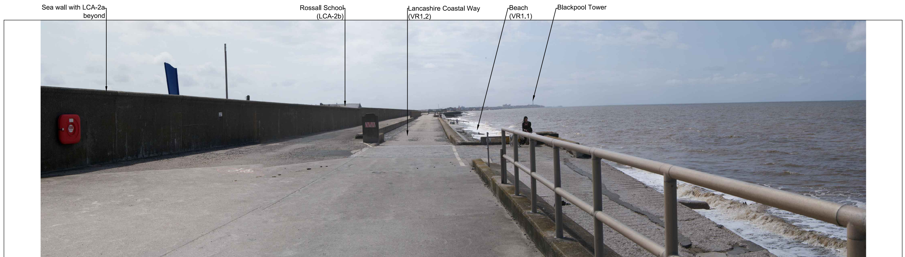
VIEWPOINT 1b, SCA 1a - VIEW LOOKING SOUTH ALONG LANCASHIRE COASTAL WAY/VR1.2 (HIGH TIDE)