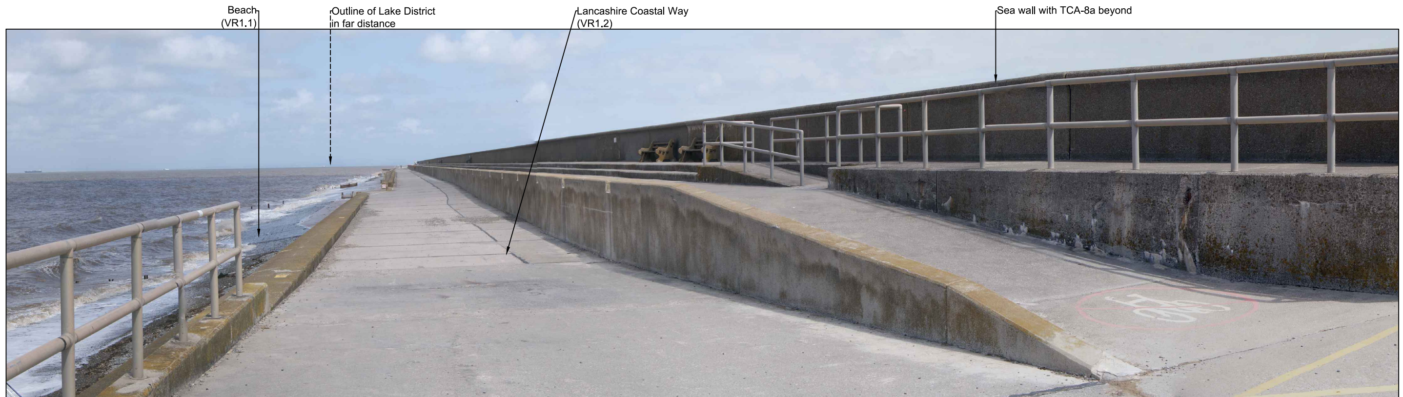
VIEWPOINT 1a, SCA 1a - VIEW LOOKING NORTH ALONG LANCASHIRE COASTAL WAY/VR1.2 (HIGH TIDE)