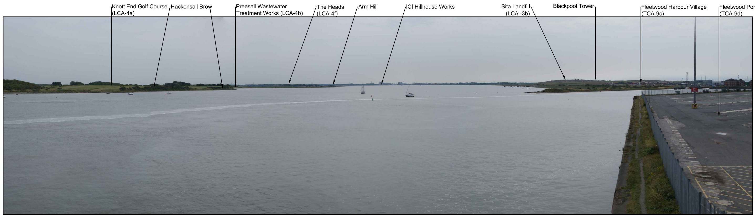
VIEWPOINT 6, SCA 1b - VIEW LOOKING SOUTH FROM FOOTPATH FP5 ALONG WYRE ESTUARY, FLEETWOOD PORT (HIGH TIDE)